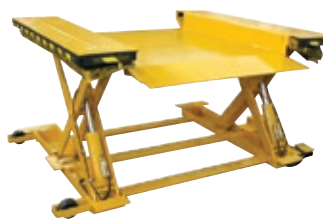
DRIVE THRU PORTABLE LIFT TABLE