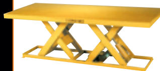
Tandem Scissor Lift