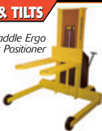
Straddle Ergo Work Positioner