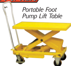
Portable Foot Pump Lift Table