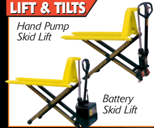
Battery Skid Lift