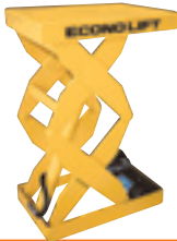
Light Duty Double Scissor Lift