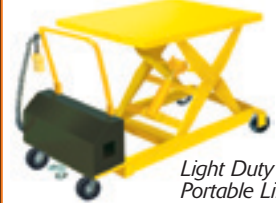
Light Duty Portable Lift