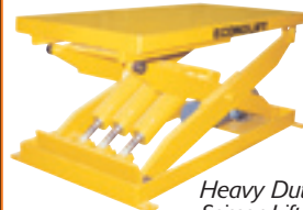
Heavy Duty Scissor Lift