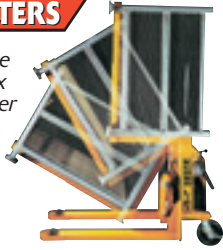
Tote Box Tilter