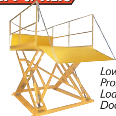
Low Profile Loading Dock