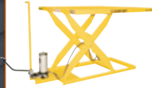
Light Duty Stationary Foot Pump Lifts