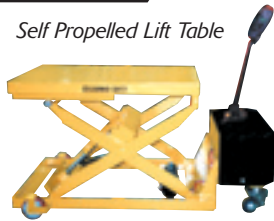
Self Propelled Lift Table