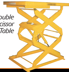
Double Scissor Lift Table