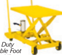
Light Duty Portable Foot Pump Lift