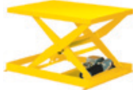
Light Duty Stationary Lifts