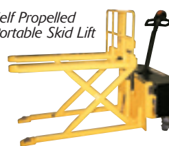
Self Propelled Portable Skid Lift