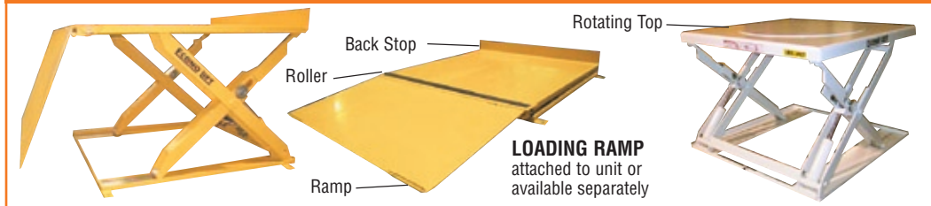
LOADING RAMP attached to unit or available separately